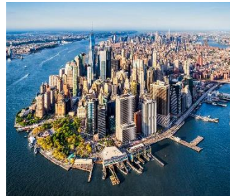
Globalaw Americas Regional Meeting (GLARM) New York, United States 1-3 June