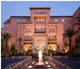
EMEA Regional Meeting Marrakesh, Morocco 16-18 March