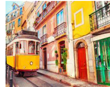
Globalaw Annual Members Meeting (GLAMM) Lisbon, Portugal 25 – 28 October