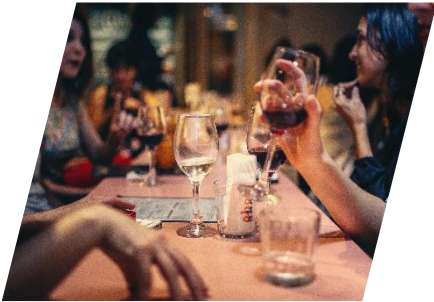
Globalaw INTA Reception (Goodwins) Singapore, 19 May